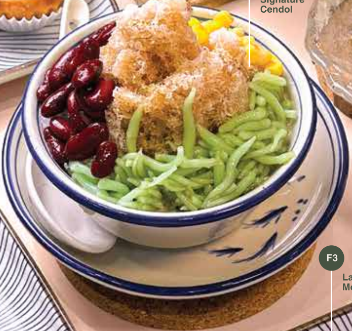
F4 Signature Cendol