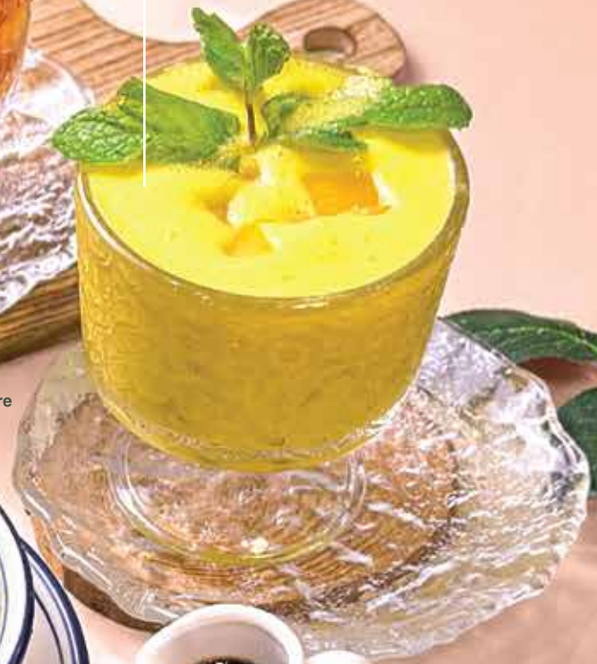
F5 Mango Pomelo Dessert