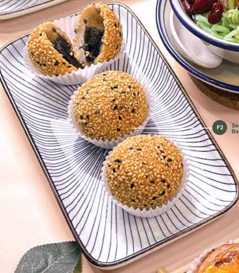
F2 Sesame Ball