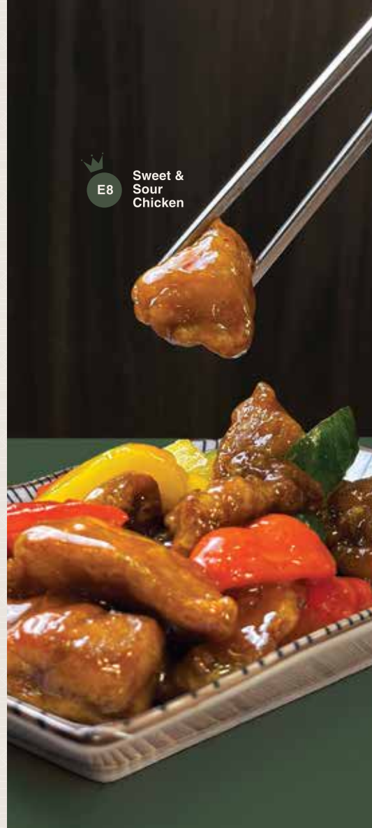
E8 Sweet & Sour Chicken