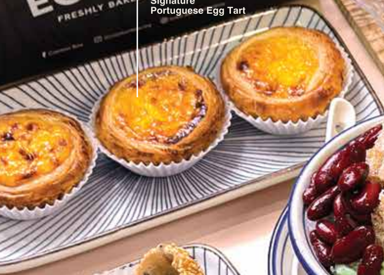
F1 Signature Portuguese Egg Tart

Golden Crust Creamy Custard CANTON BOY FRESHLY BAKED EVERYDAY PORTUGUESE EGG TART