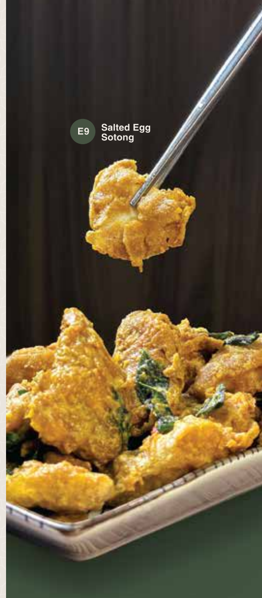
E9 Salted Egg Sotong