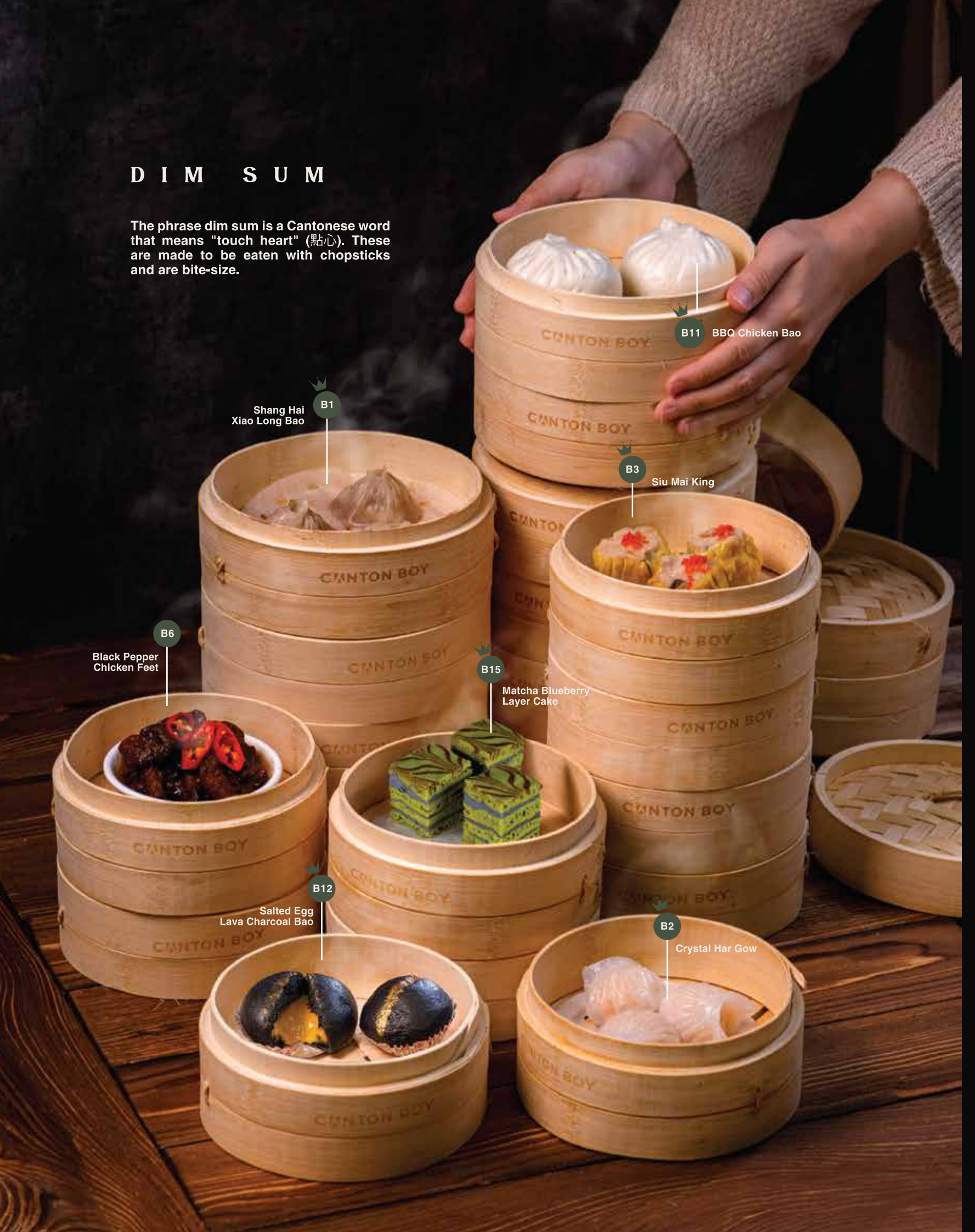
B2 Crystal Har Gow