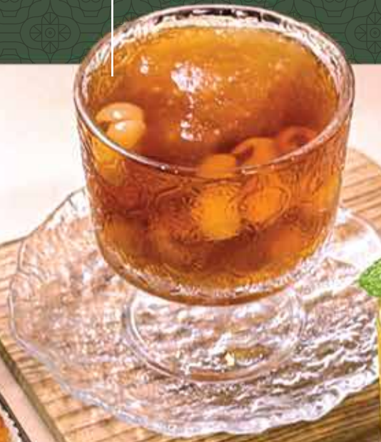
F6 Longan & Sea Coconut Dessert