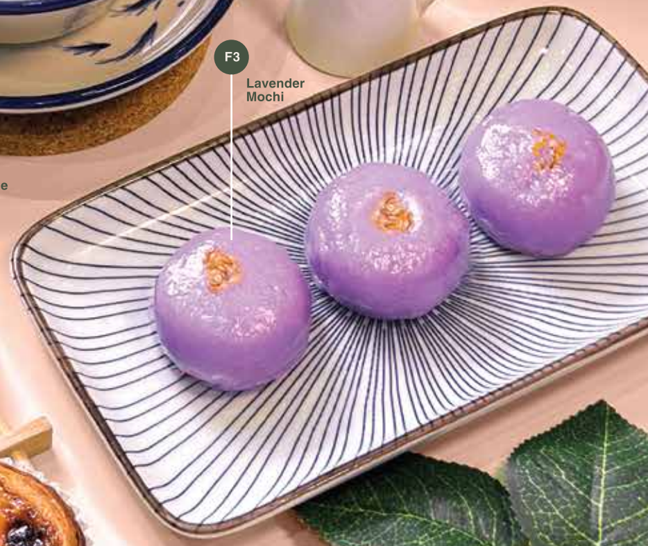
F3 Lavender Mochi