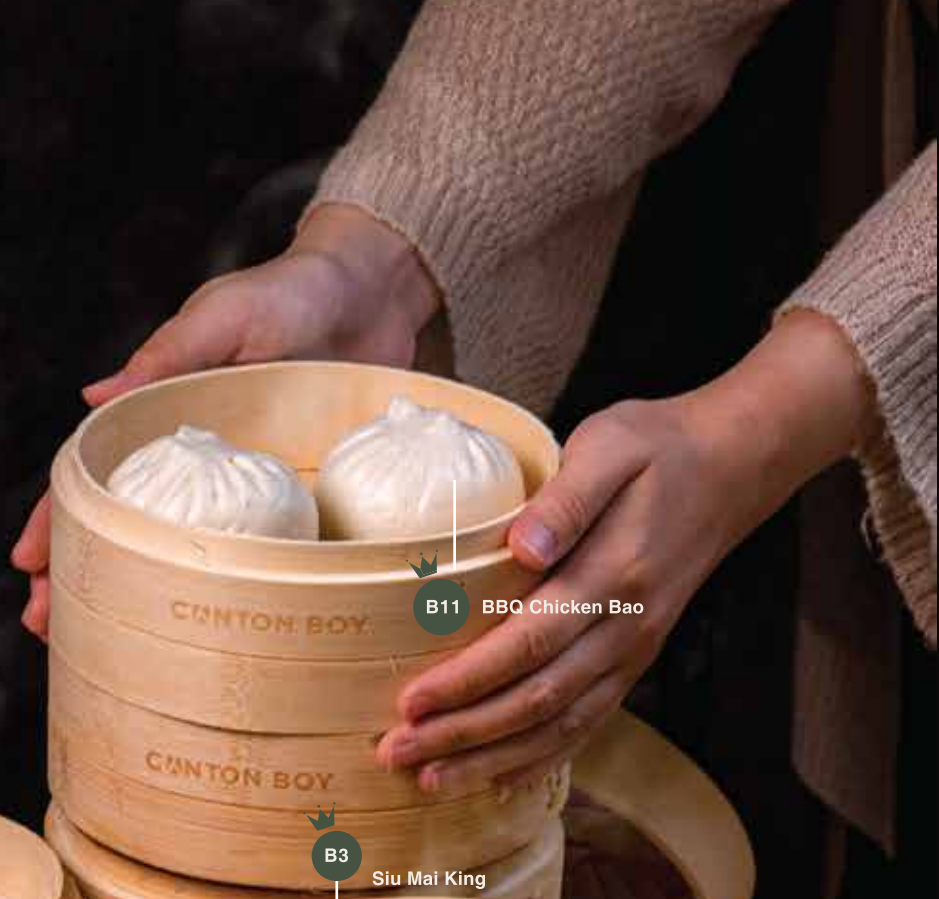
B11 BBQ Chicken Bao

The phrase dim sum is a Cantonese word that means "touch heart" (點心). These are made to be eaten with chopsticks and are bite-size.